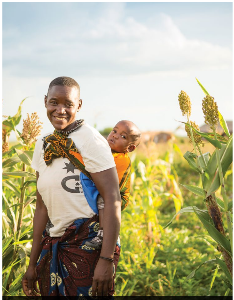
World Vision Canada: Mother poses in a plentiful crop with her baby as part of the Enhancing Nutrition Services to Improve Maternal and Child Health (ENRICH) program.

In 2018, OCLF with MGMGP support established seven mini-libraries in salt mining and fishing villages in Ghana. This year of the project will continue this outreach with a transition to have the communities assume more financial responsibility and leadership.