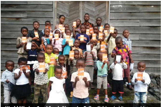
World Mission Good Seeds/Namwira Folks: Children holding pamphlets in the DRC.