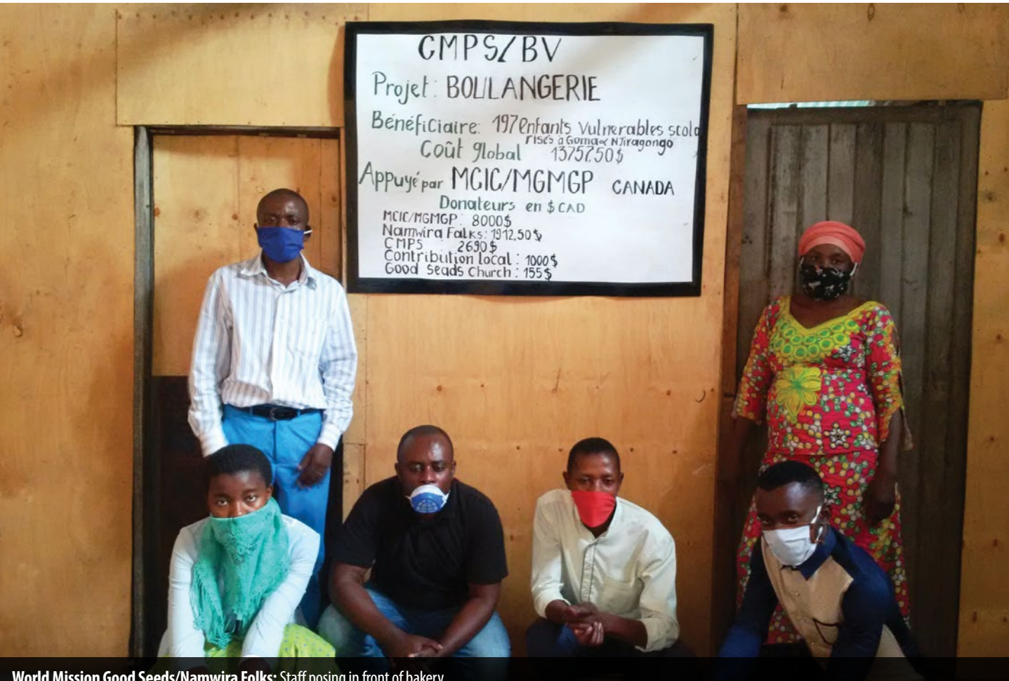
World Mission Good Seeds/Namwira Folks: Staff posing in front of bakery.