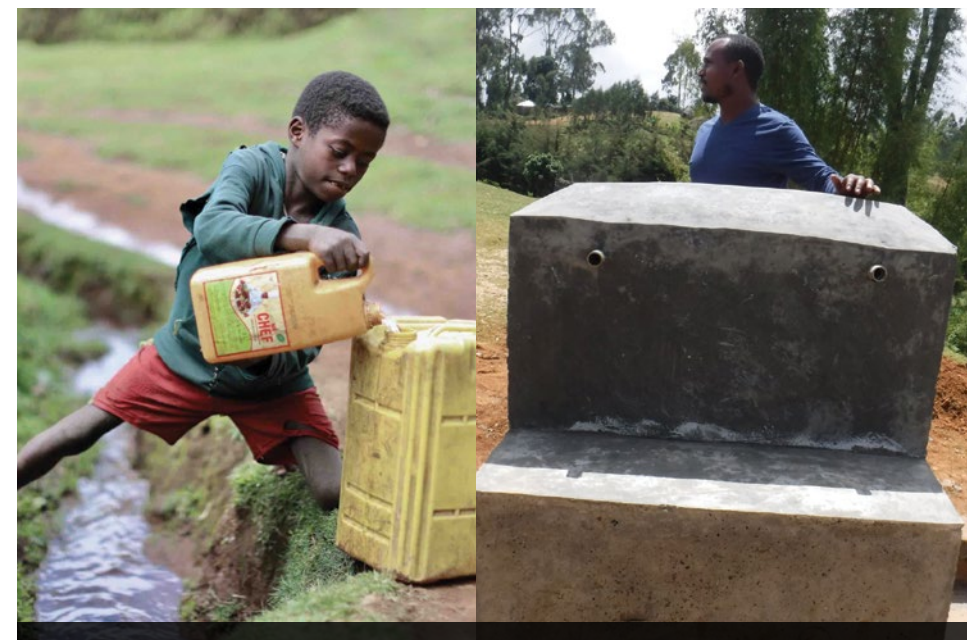
Hope International Development Agency: (Left) Boy from Zala Dola, Ethiopia, fetches water prior to the construction of the gravity fed water system. (Right) Completed construction of the gravity fed water system.

This project aims to support women farmers to adopt agriculture technologies and access relevant information on changing weather patterns via their smart phone. With the help of a new mobile phone application, women will be able to receive weather forecast information for their area, connect with agricultural experts for guidance, and access training. This will allow them to become more resilient to the effects of climate change, improve food security and will result in improved standard of living for these small scale farmers.