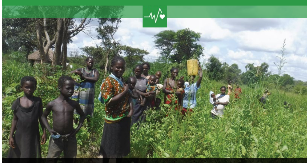
Hope International Development Agency: Some South Sudanese community members on the road to Maruko.